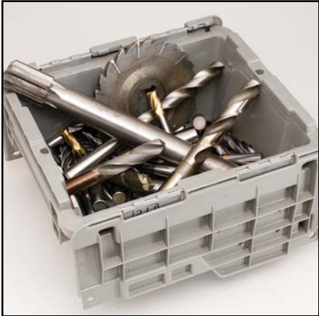
Recondition your used Cutting Tools

Save money!!! Reduce your Tooling Budget!!!