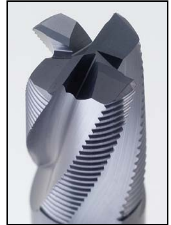
After... Just like new... Sometimes even better.

Recoating: TiALN, TiCN, TiN, ALTiN, TiB2 are some of the coatings offered.